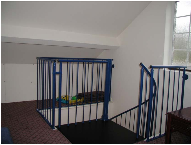
2000 series rails around a square opening paint colour RAL 5010 (sp gallery 18)