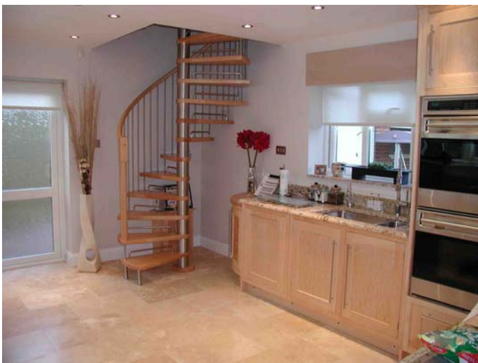
Model Magnolia (formerly Tiffany) diameter 1400mm with stainless steel column sleeve and handmade half risers (sp gallery 5)