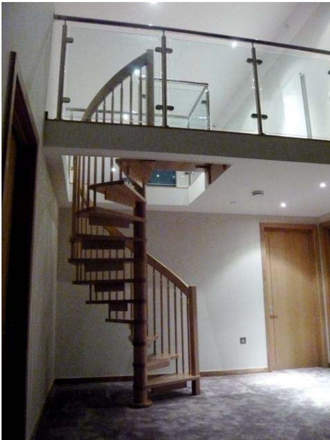
Model Gardenia (formerly Linus) diameter 1500mm in clear beech with half risers