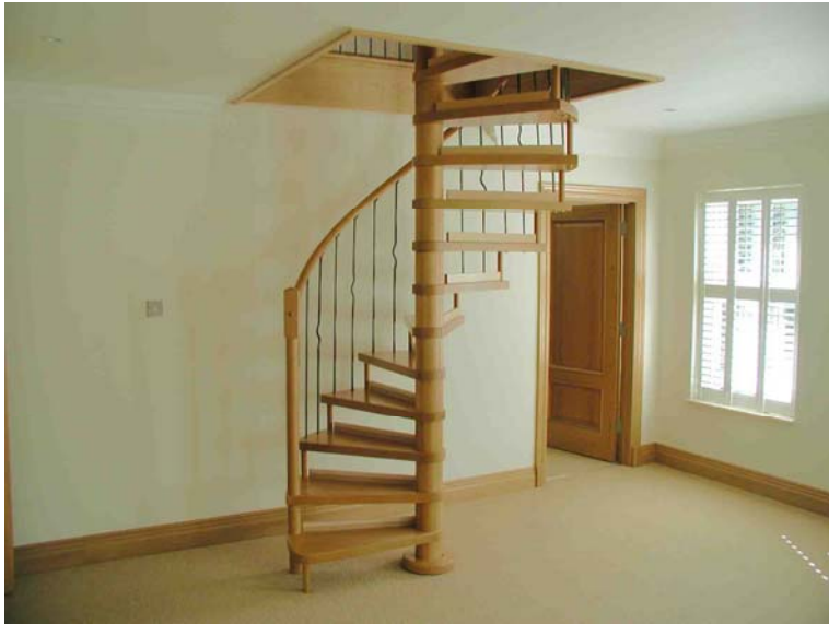
Model Magnolia (formerly Tiffany diameter 1500mm with half risers and handmade uprights (left sp gallery 10/right sp gallery 11)