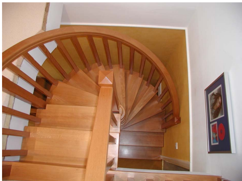
Model B2L diameter 1500mm with straight entry and exit (left sp gallery 12/right sp gallery 13)