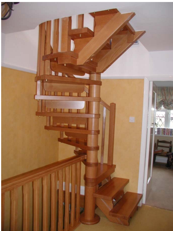
Model B2L diameter 1500mm with half risers, straight entry and exit (left sp gallery 12/right sp gallery 13)