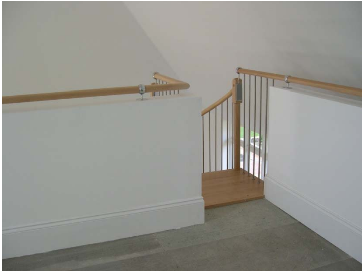
Model Magnolia (formerly Tiffany) diameter 1900mm in clear beech with a quarter landing, top handrail fittings by customer. (please swap this for 4)