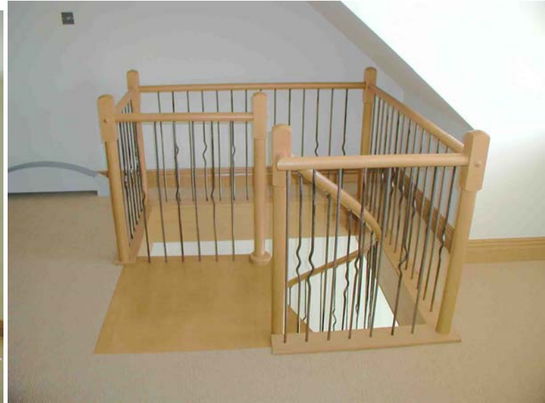
Model Magnolia (formerly Tiffany diameter 1500mm with handmade uprights (left sp gallery 10/right sp gallery 11)