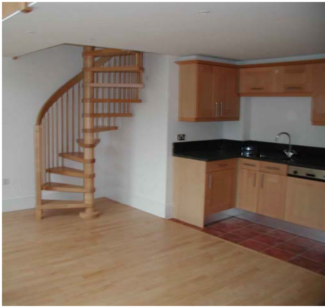
Model Gardenia (formerly Linus) diameter 1500mm in clear beech (left sp gallery 1)