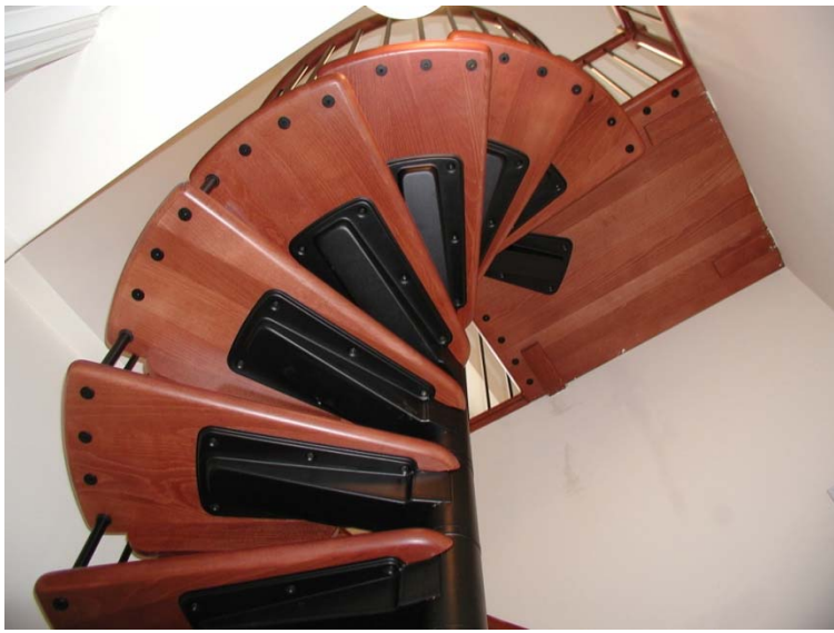
Model 2000S diameter 1400mm with cantilevered treads (left sp gallery 14/right sp gallery 15)