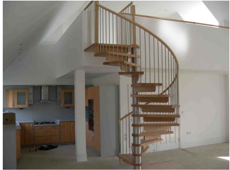
Model Magnolia (formerly Tiffany) diameter 1900mm in clear beech with half risers, a quarter landing and stainless steel column sleeves, (please swap this for 3)