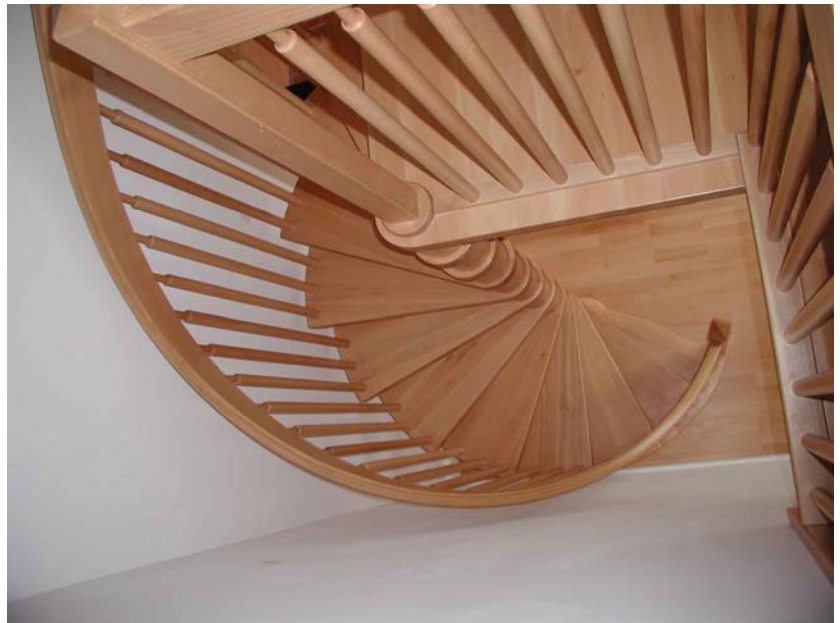
Model Gardenia (formerly Linus) diameter 1500mm in clear beech with a quarter landing (right sp gallery 2)