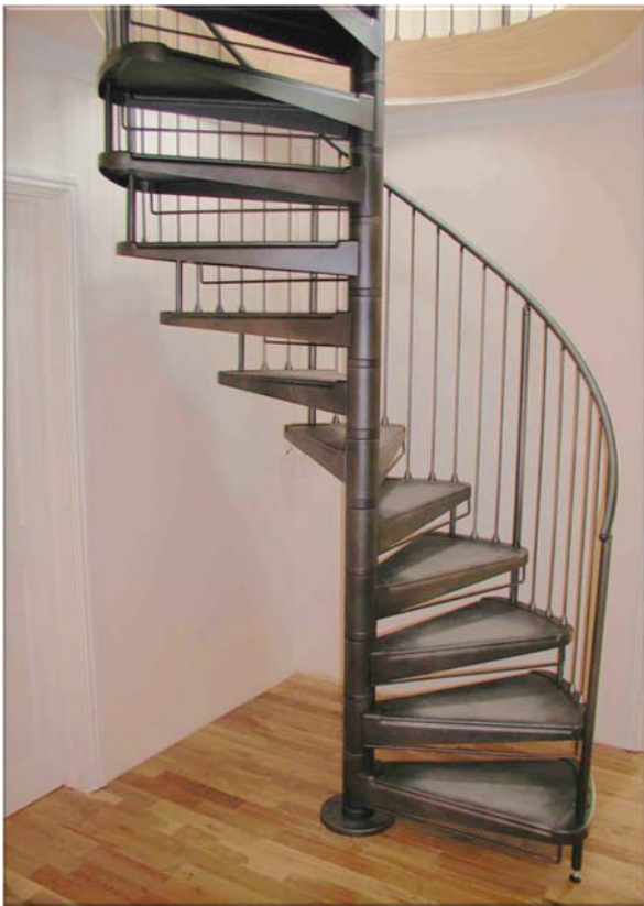
Model 2000F diameter 1500mm in black graphite finish with riser bars and rubber covered treads fitted in a circular opening (left sp gallery 16/right sp gallery 17)