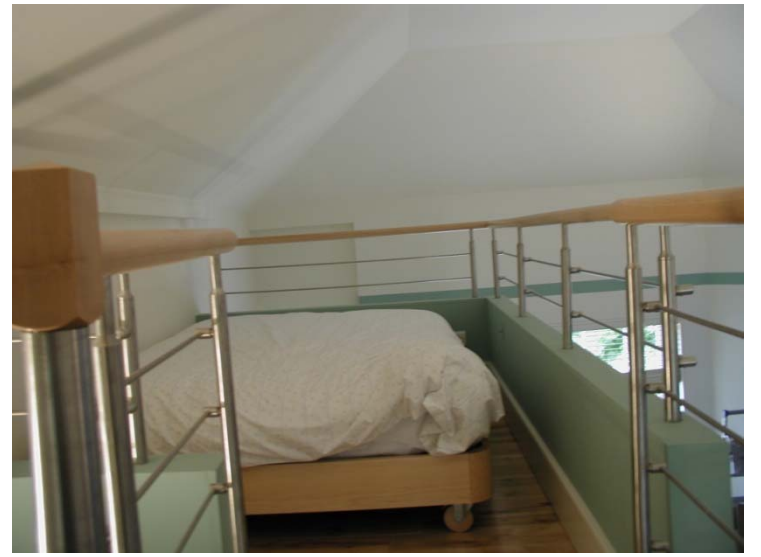
Model Ninfea (formerly Portofino) diameter 1500mm leading to bed platform (sp gallery 9 & 9a)