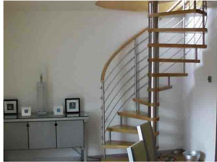
Model Ninfea (formerly Portofino) diameter 1500mm with top balustrade by customer (please swap with 8)