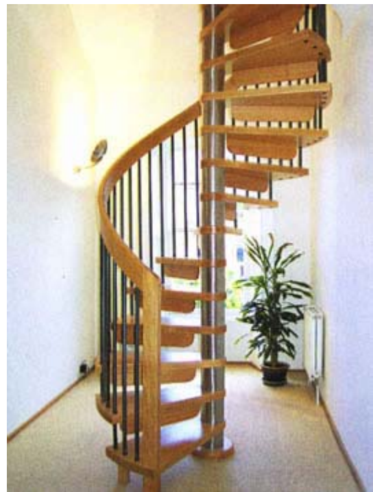
Model B9 diameter 1500mm with half risers and stainless steel column sleeves (sp gallery 6)